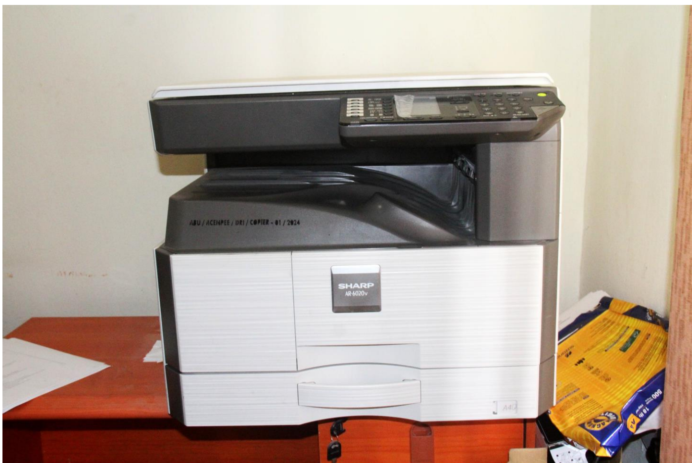
1 Number Photocopier