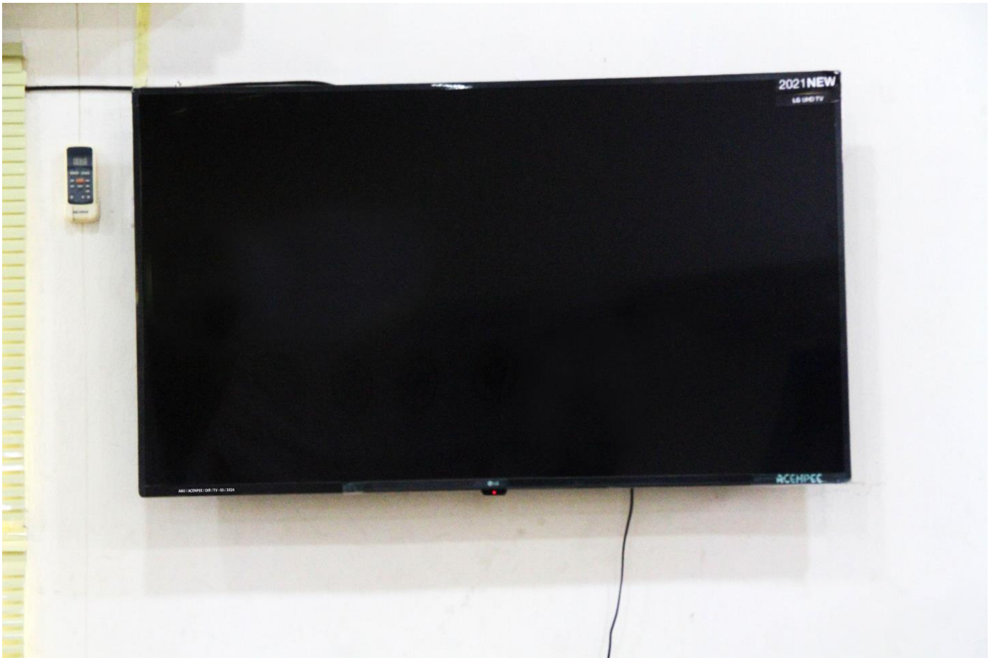
2 Number 43 Inch Smart TV