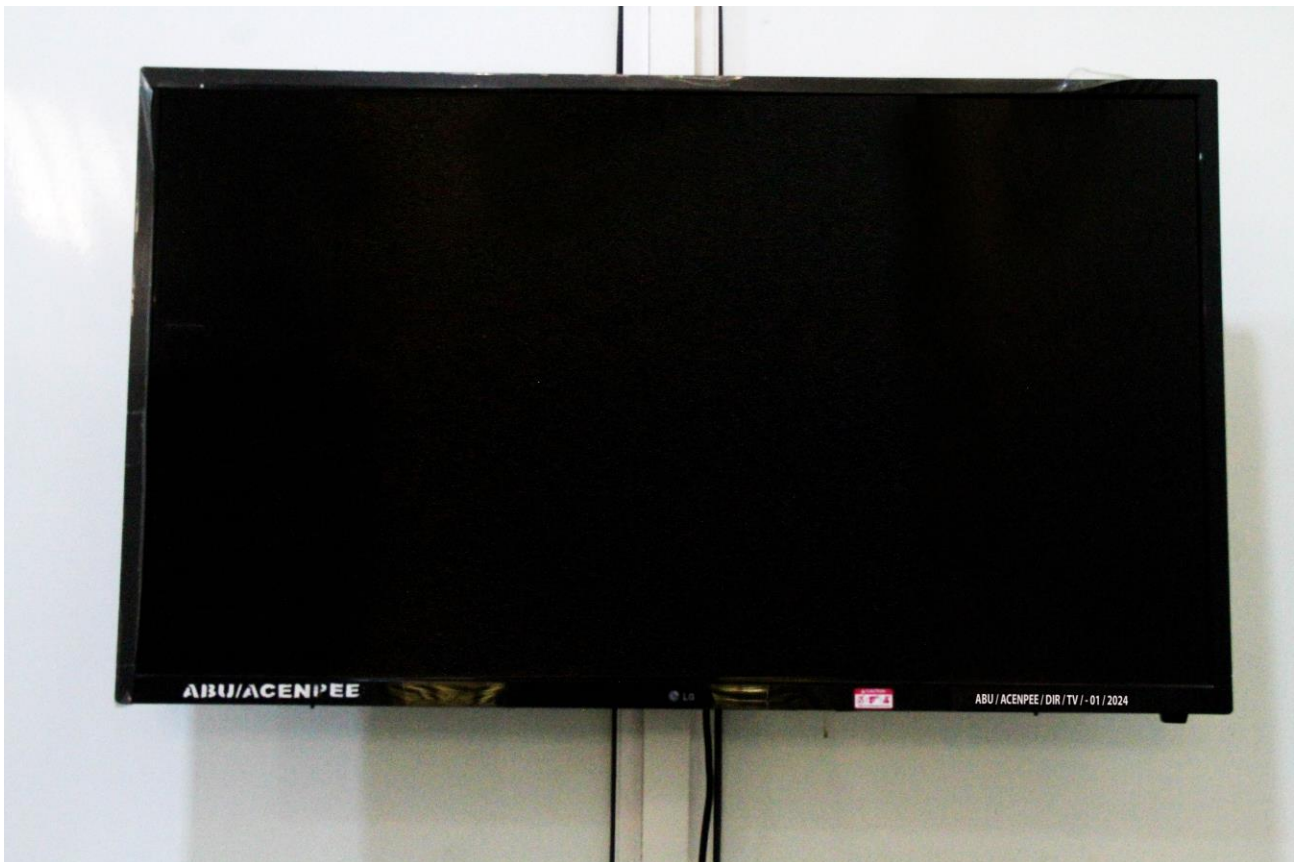
1 Number 55 Inch Smart TV