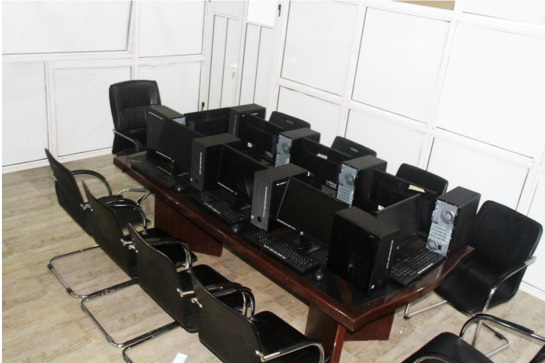
8 Number Desktop Computers