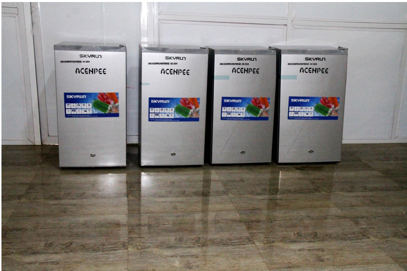
4 Number 90 litre Office Fridges