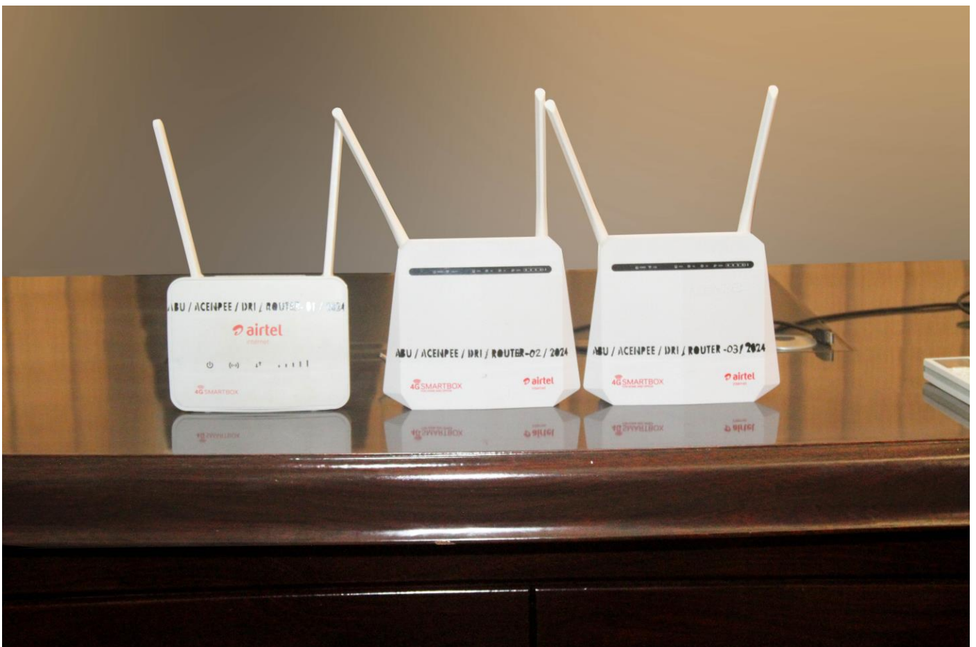
3 Number Internet Routers