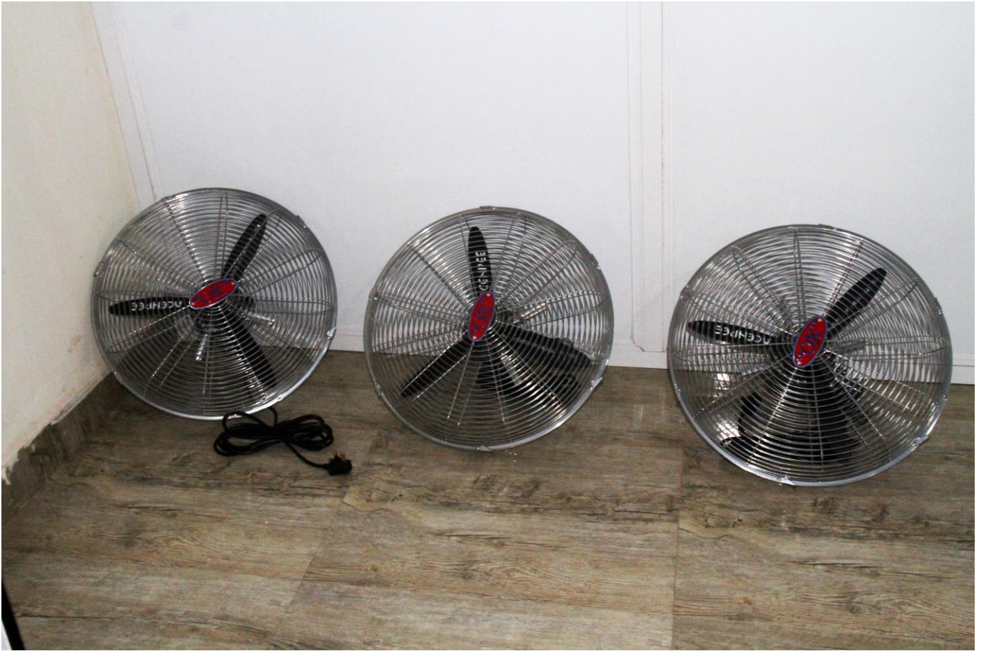
3 Number Office Wall Fans