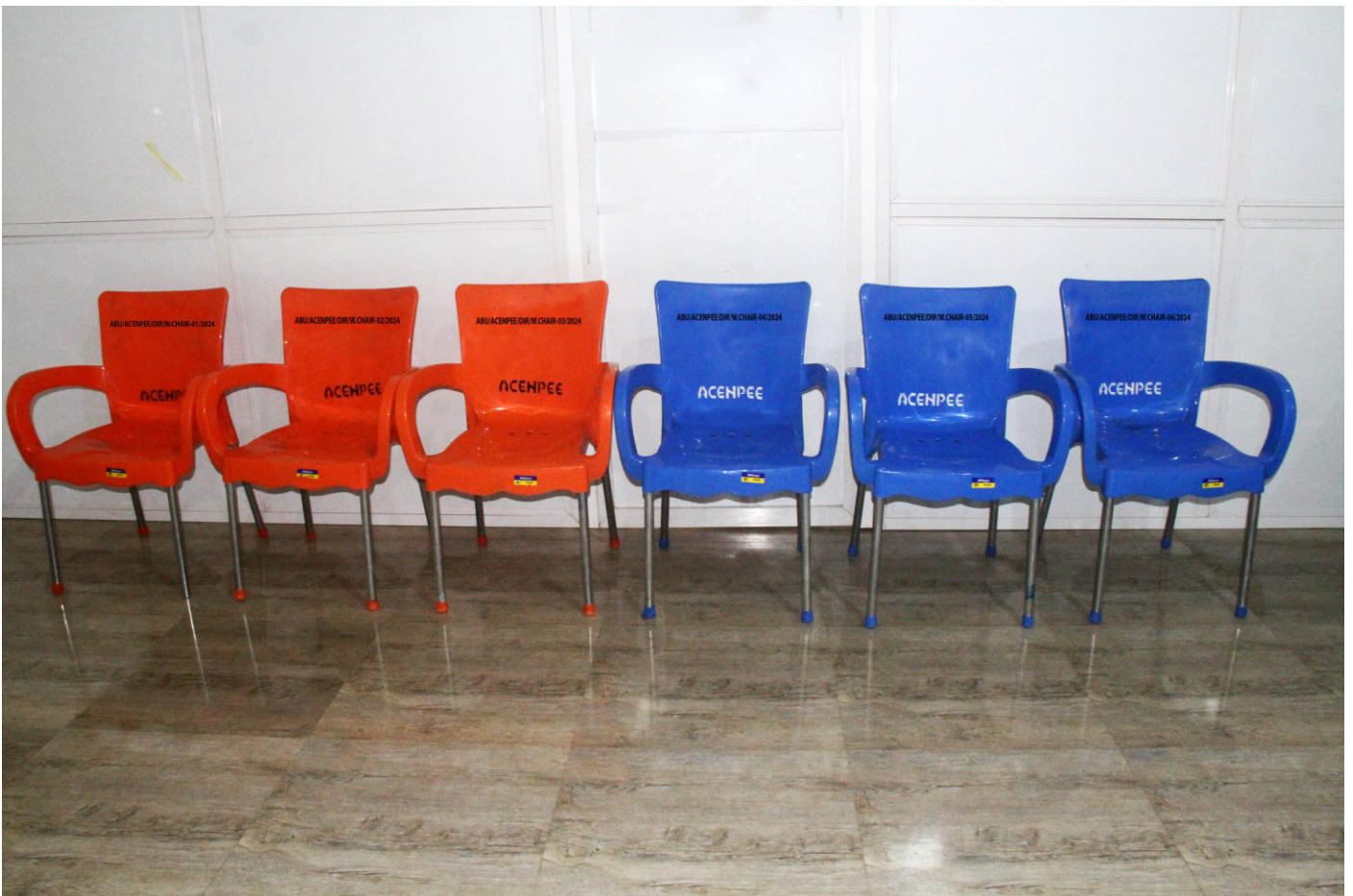
6 Number Office Waiting Chairs