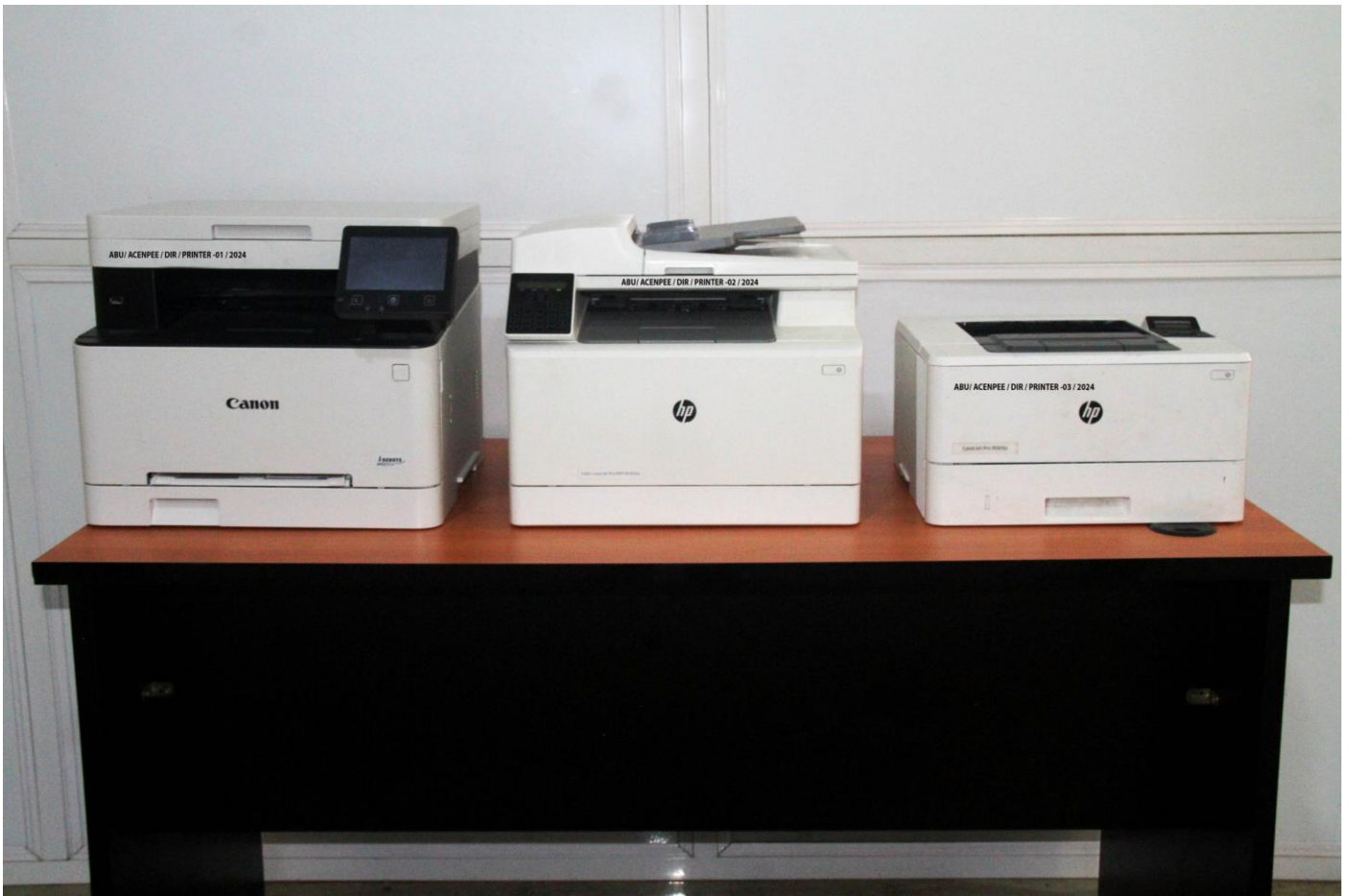
3 Number Office Printers