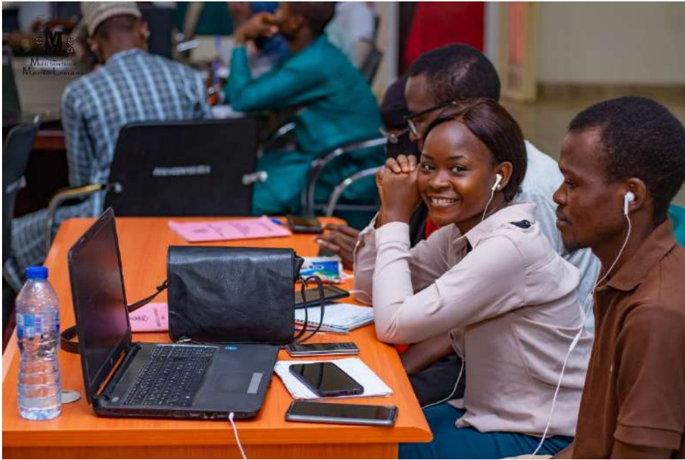
Plate 9: Training presentation for both physical and online participants