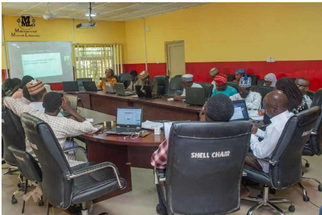
Plate 5: Training presentation for both physical and online participants at the alternate venue (Shell Chair in Mechanical Engineering)