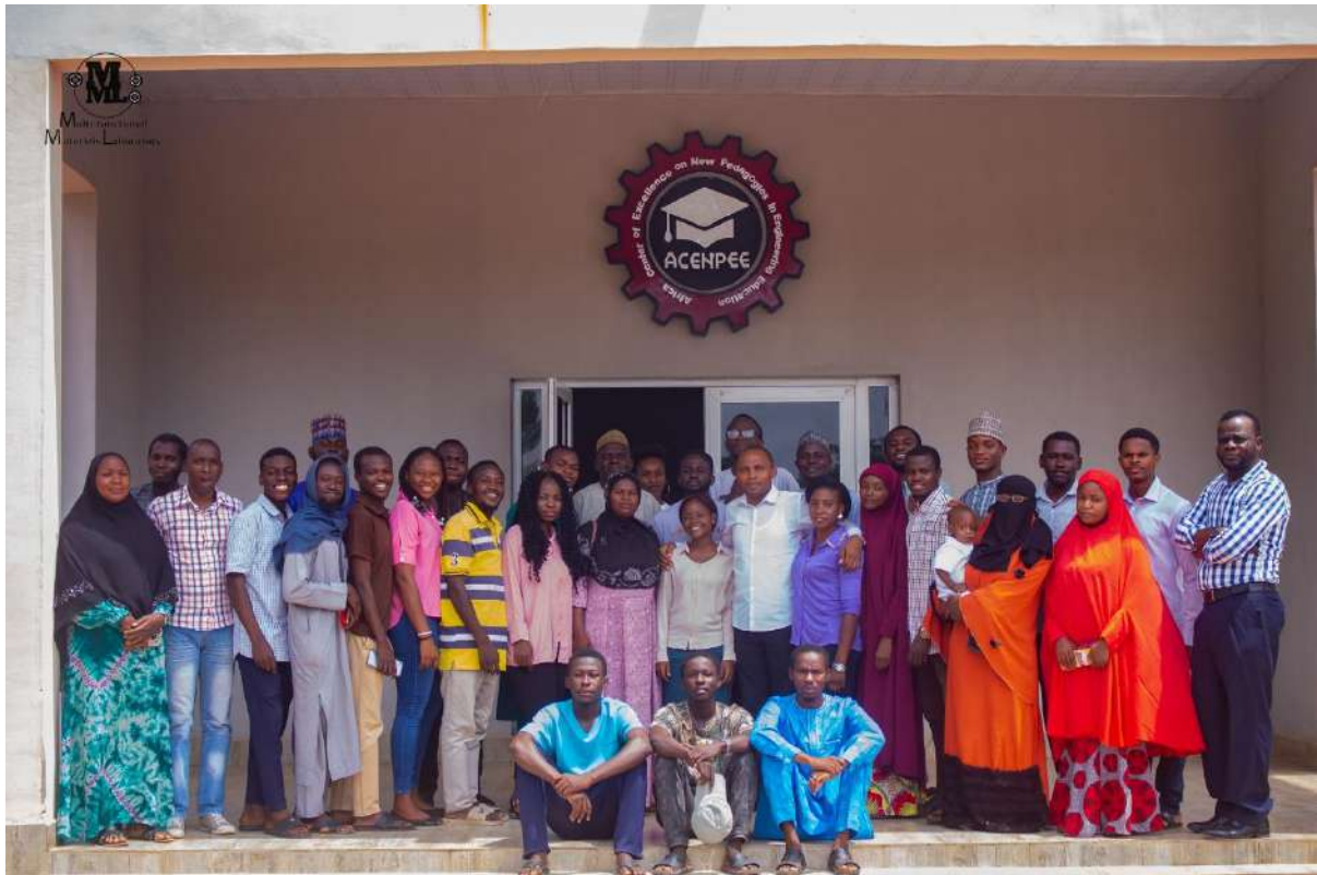
Plate 2: DAY 2- Group photo of some physical participants during the training