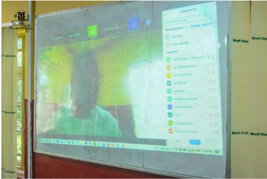
Plate 6: Live Training presentation for both physical and online participants