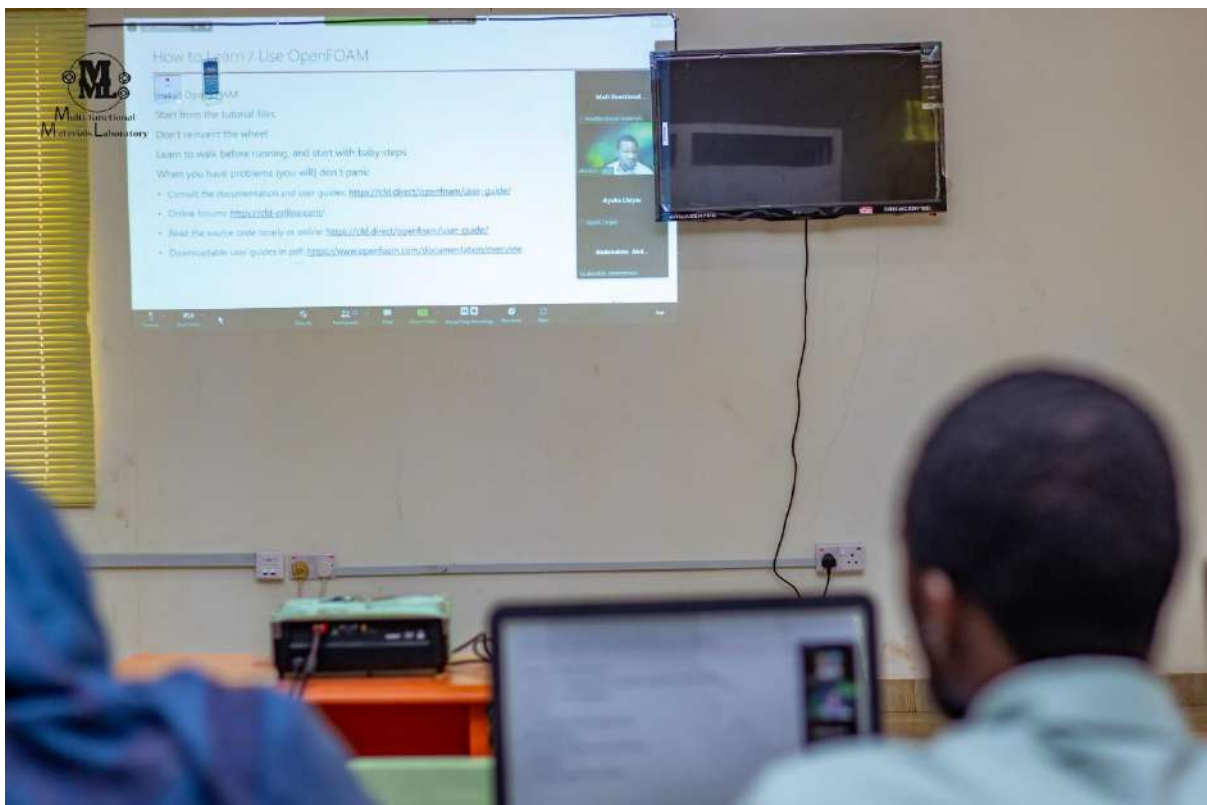
Plate 3: Training presentation for both physical and online participants