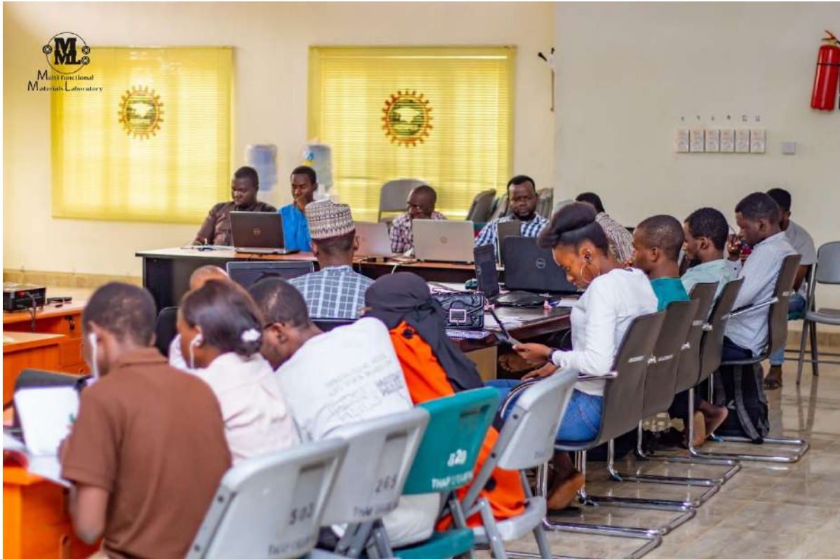
Plate 11: Training presentation for both physical and online participants