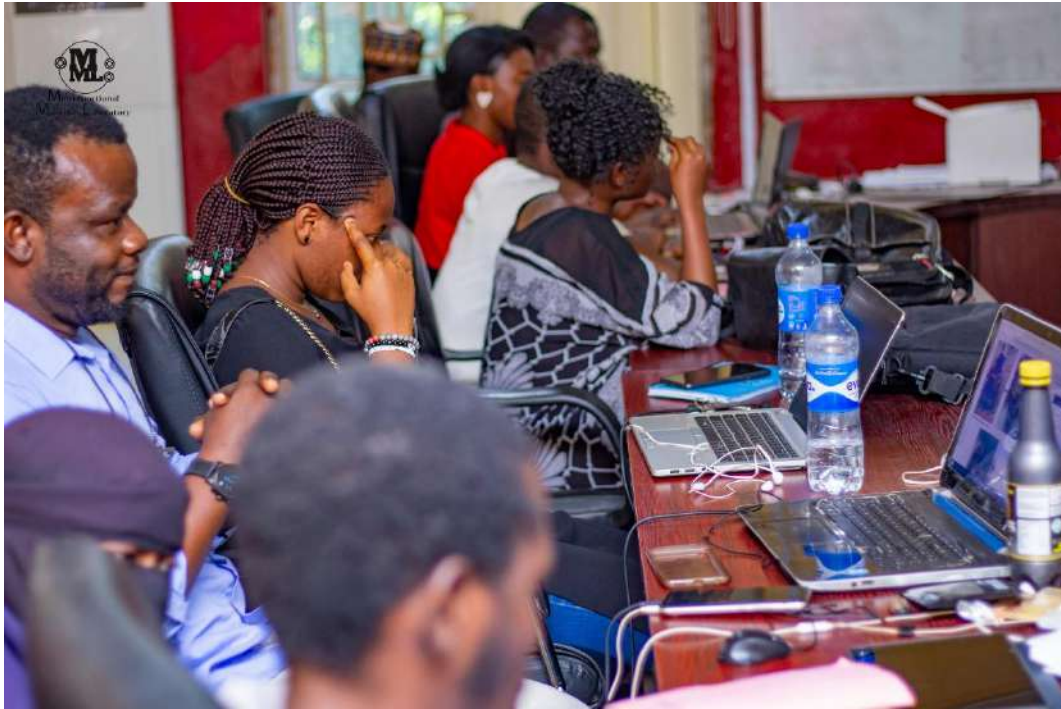
Plate 4: Training presentation for both physical and online participants