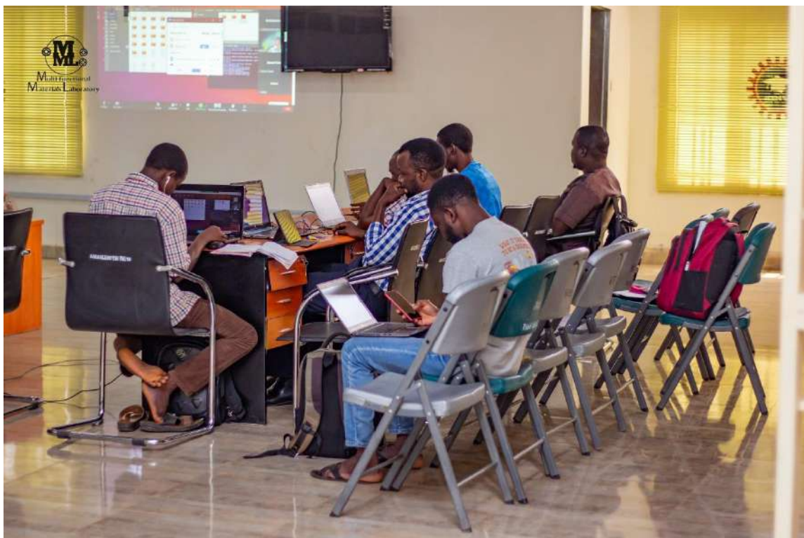
Plate 10: Training presentation for both physical and online participants