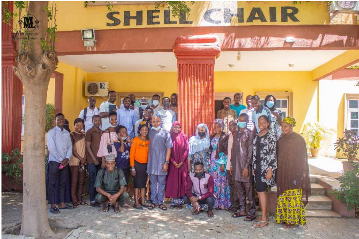
Plate 7: Physical participants at the venue of one of the practical sections