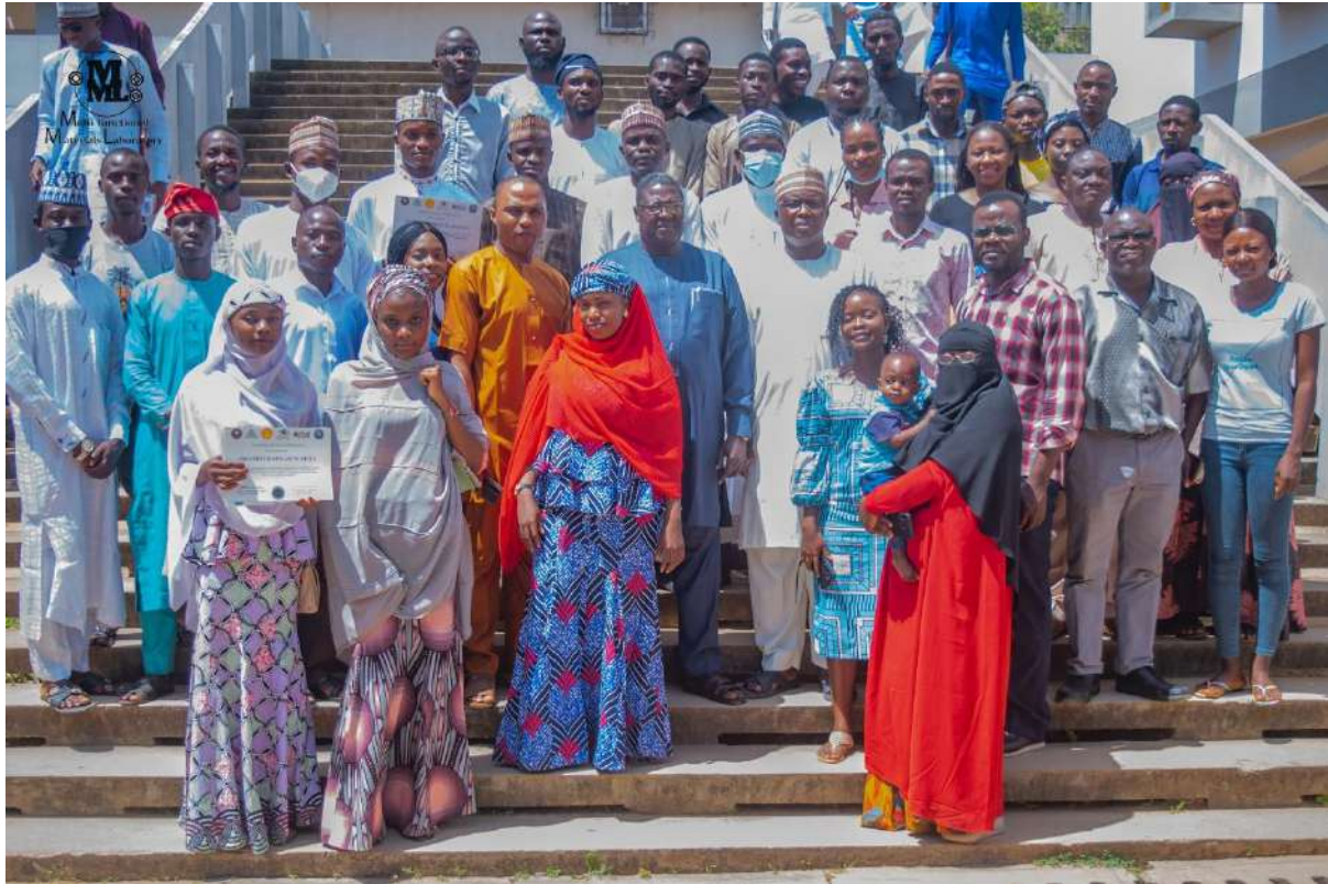
Plate 16: Day 10- Group photo of some participants and ACENPEE Project Management Committee on the closing ceremony